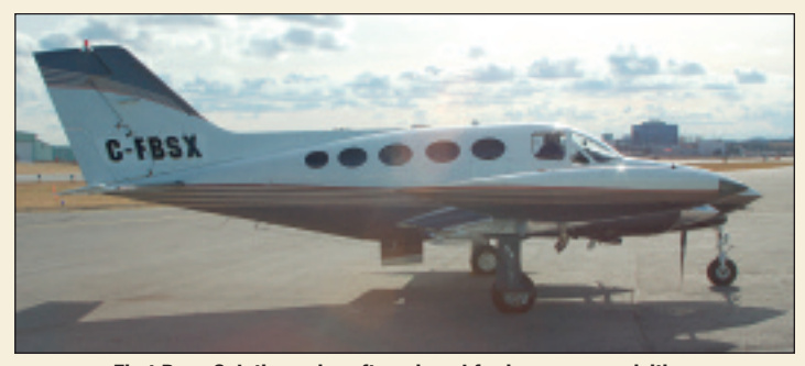
First Base Solutions aircraft equipped for imagery acquisition.

Collected April 2013 Number of days to acquire imagery = 11 Number of planes used = 1 Number of sq km = 7,029 Number of flight lines = 122 Total length of flight lines = 6,035 km Number of images = 12,694 Size of the data = 1Tb