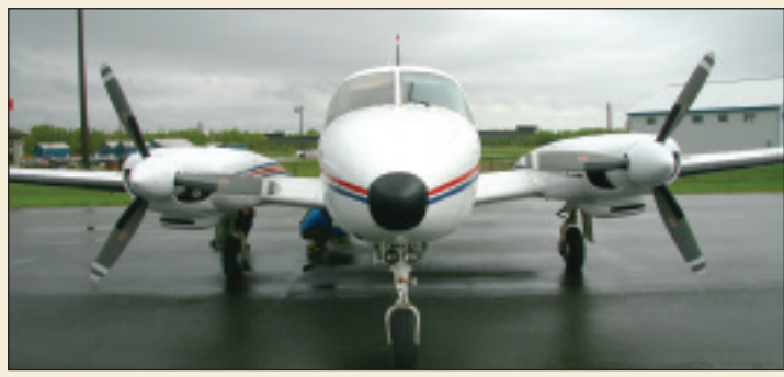
Fugro aircraft equipped for imagery acquisition.